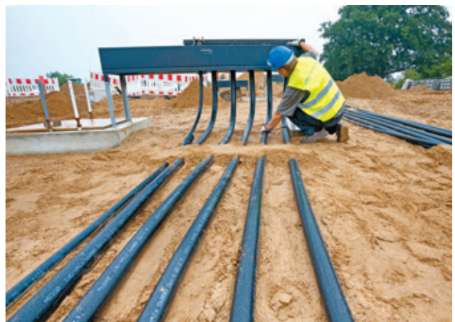
Laying the piping to the future petrol pumps

And of course, choosing such an idyllic location has its price. Anyone who wants to build one or two petrol stations here is faced with the most stringent environmental protection requirements anywhere. In the knowledge that all these environmental requirements must be complied with and planned in with state-of-the-art technology, one of