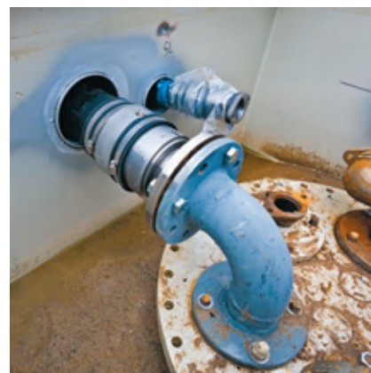
The fully installed connection fitting

In all, • 900 m SEC DN 40 for the suction lines • 400 m SEC DN 100 for the fill lines • 100 m CNT 30/39 for vapour recovery • 20 m LPG DN 20 und DN 25 for LPG were built in, including all ancillary equipment.