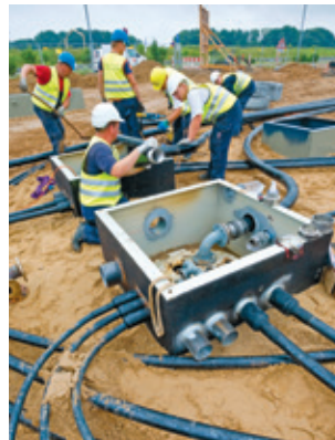
Laying the filling line