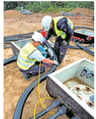
Bending the piping