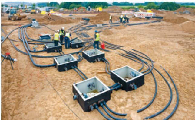
Overview of the site

Initial discussions on the scheduling took place between BRUGG and ARTELIA in February 2013. BRUGG played a supporting role in drawing up the piping plan for the northern side. The planned piping for all fuel products was to be double-walled SECON®-X. BRUGG first received the order to supply the material for the north side. The installation of the piping for its mirror-image twin on the south side, here also SECON®-X, was staggered with a time lag.