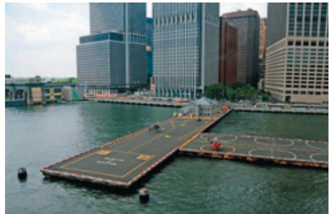
Wall Street Heliport in Manhattan/New York City

Core Engineered Solutions is a firm, which specializes in fuel storage and supply system installations for applications such as diesel generators, emergency power systems, wastewater treatment plants, and aviation