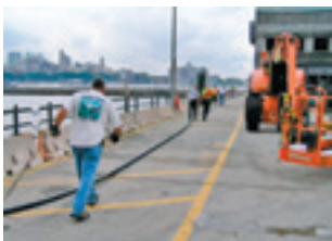
Deployment of 500 ft. of FLEXWELL-HL pipe

With temperatures approaching 100 degrees, the pipe installation was completed in July 2010 with the expert assistance from BRUGG