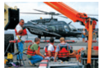
Installation work during ongoing helicopter traffic