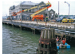
Final attachment of the pipe to the pier