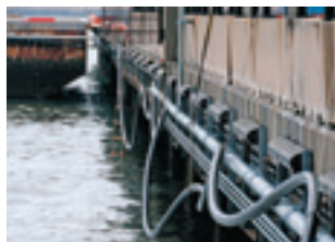
Temporary attachment of the pipe