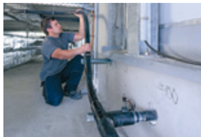
Excellent flexibility – it is no problem to lay the piping through multiple changes of direction