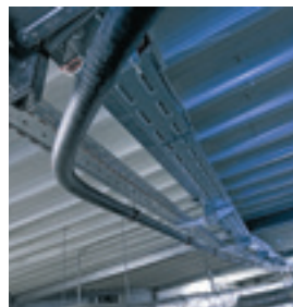
Ideal routing for the new propane feed lines