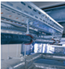
Simple securing of the piping with our systems technology

The well laid out routing scheme planned beforehand showed once again when work began that every theory is only as good as the actual conditions encountered in practice on site permit. The pipe routing was constantly being altered because it transpired that the routing plan was not feasible. In the basement area, the double-walled pipes had to be laid through utility rooms, corridors and sanitary facilities; and this always meant running them directly beneath the ceiling, mostly suspend-