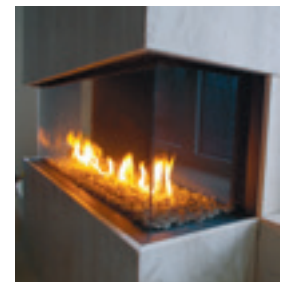
Cosy in front of the propane fire