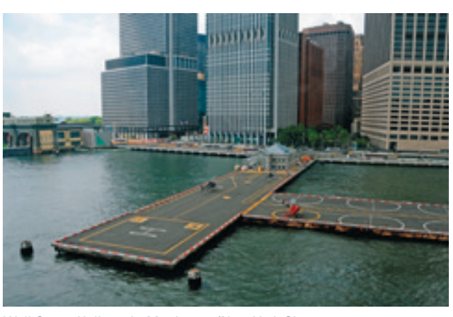
Wall Street Heliport in Manhattan/New York City

fueling installations. Core's leading product line is "Convault", a manufacturer of concrete reinforced fuel storage tanks. Core was awarded the contract to construct a new fueling terminal for the prominent and highly visible Wall Street Heliport. This heliport is located on the East River, very close to "Ground Zero". In order for this project to be approved and completed, Core was required to use piping material which was marina-proof, flexible, sturdy and resistant to UV exposure. BRUGG FLEXWELL-HL pipe met all of these requirements. Thanks to the efforts of BRUGG's Manufacturer's Representative, Yeager Engineered Systems, Core was introduced to the right pipe for the job. To complete this project, 560 feet of 2" pipe, 20 feet of 3" pipe and a total of 8 couplings were used.