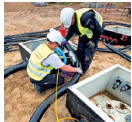
Bending the pipe