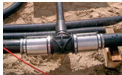
Double walled SECON®-X Tee piece

Optional – if necessary later – it's the possibility to integrate the pipe system in leak detection. This will be a very interesting detail for Fill pipes, Suction pipes and as well for vapor recovering lines stage I and stage II.