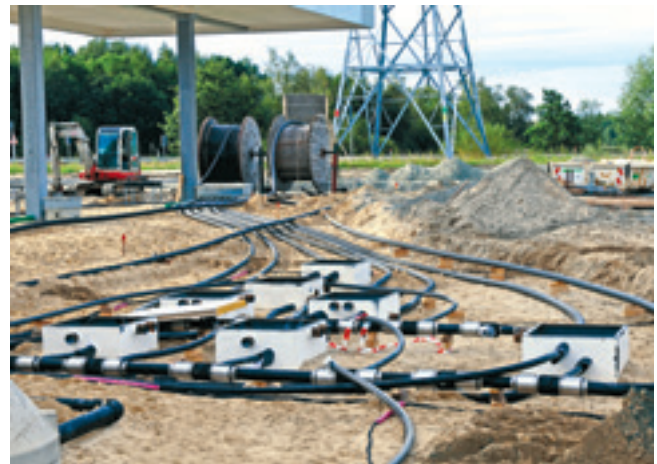
Laying the filling pipes directly off the drum

The new building is in a designated water protection reserve, so that it was compulsory to use double-walled and leak-monitored piping for carrying the fuel. The Office of Environmental Protection in the port of Bremerhaven was particularly concerned that double-walled petrol station piping should be used on the premises of the service area. BRUGG cooperated with the professional planners and the architects' office to draw up a project design for a double-walled piping network. All the requirements according to water Law and Environmental Protection Law needed to be complied with in this.